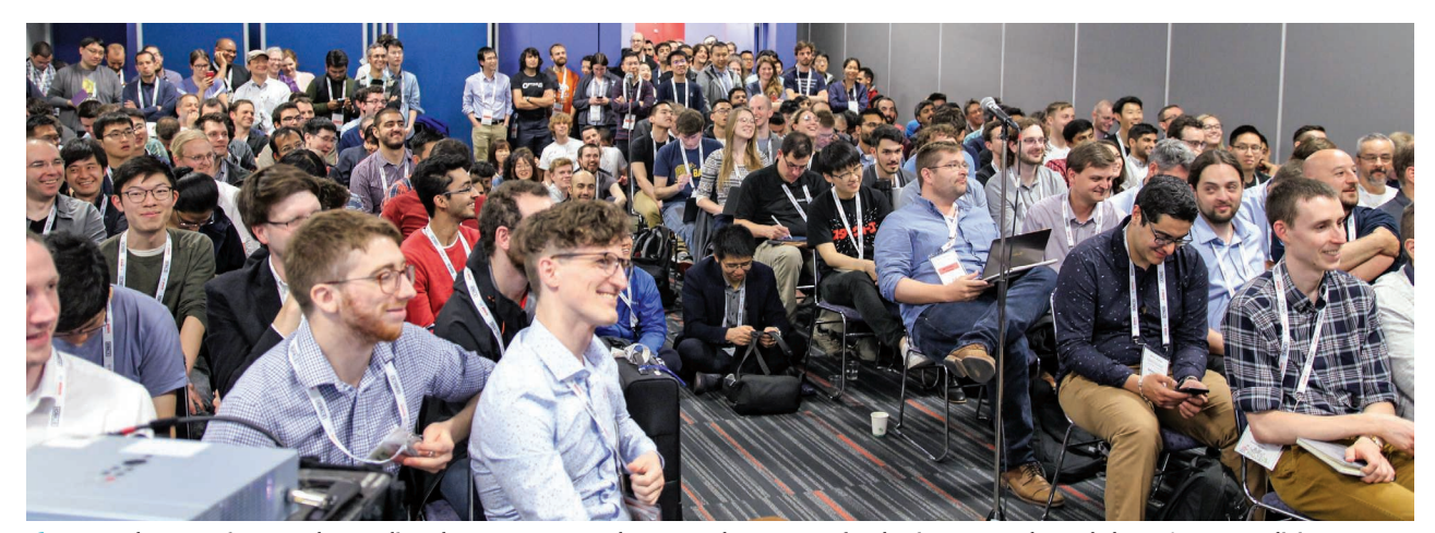
Figure 1. The capacity crowd attending the 2019 ICRA Debates on the Future of Robotics Research workshop.

The "against" side highlighted the interdisciplinary nature of robotics, noting that many successful ideas, such as learning-based methods, have emerged from cross-pollination between fields. They suggested that large conferences serve as an essential